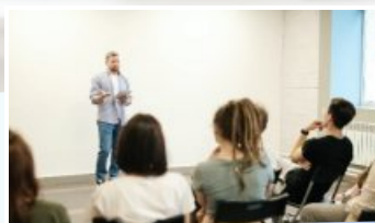
Classroom (face to face) training

Check out our ★★★★★ reviews on Google and Trustpilot