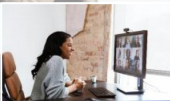
Live online remote lessons