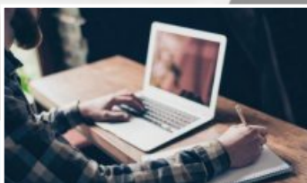
Self-study (distance learning)

We offer flexible ways to study the qualification: